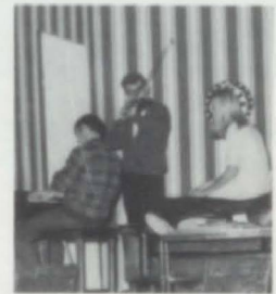
"Fiddlers Fantasy" and "Organ Players Delight."