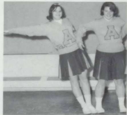
Something is definitely wrong.