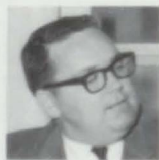
Faces of authority.